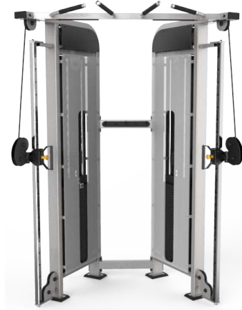
دوکابلی - کراس نزدیک

Product Size: 1550*660*1400 mm (LxWxH) Product Weight: 200 kg Weight Stack: 75 kg