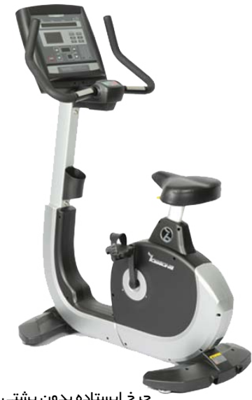
چرخ ایستاده بدون پشتی