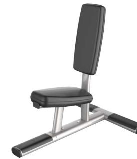
صندلی چند منظوره

Product Size: 1280*2300*930 mm (LxWxH) Product Weight: 77 kg