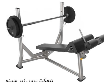
نیمکت پرس زیر سینه

Product Size: 1890*930*510 mm (LxWxH) Product weight: 50 kg