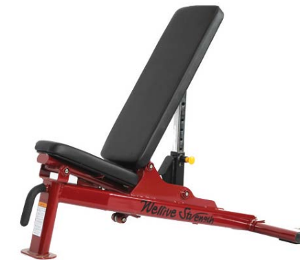
نیمکت چند منظوره چند حالت

Product Size: 1660*1650*2240 mm(WxLxH) Product Weight : 120 kg Color Frame: Silver / White / Yellow/ Red / Blue / Black.