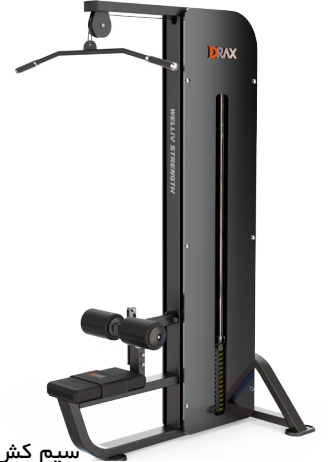
سیم کش لت

Product Size: 1040*1450*1630 mm (LxWxH) Product Weight: 190 kg Weight Stack: 75 kg