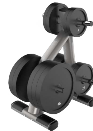
مقر صفحه هالتر

Product Size: 670*1740*940 mm(LxWxH) Product Weight: 30 kg