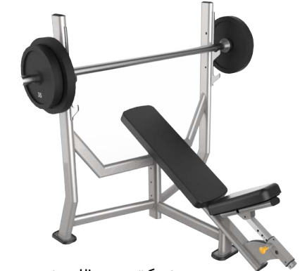
نیمکت پرس بالا سینه

Product Size: 1300*1245*1300 mm (LxWxH) Product Weight: 68 kg