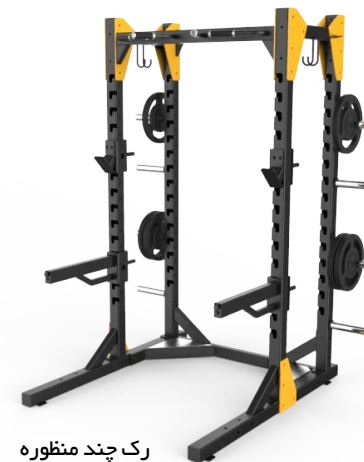
رک چند منظوره

Product Size: 1490*910*2210 mm(LxWxH) Product Weight: 64 kg