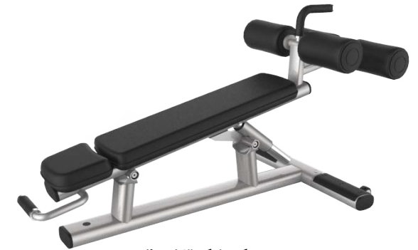
نیمکت شکم قابل تنظیم

Product Size: 710 * 900 * 900 mm (LxWxH) Product Weight: 23 kg