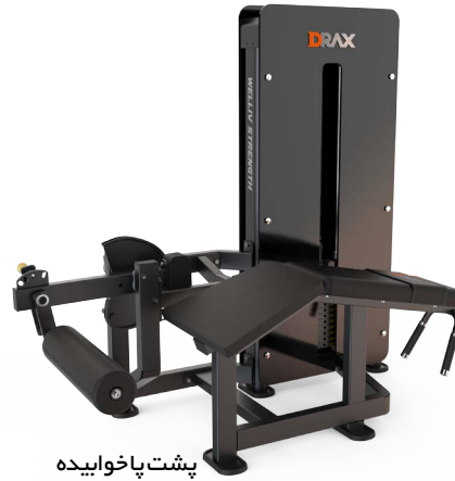
پشت پا خوابیده

Product Size: 1400*880*1600 mm (LxWxH) Product Weight: 200 kg Weight Stack: 75 kg