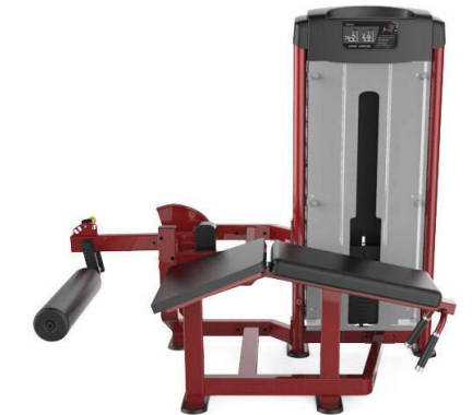
پشت ران خوابیده

Product Size: 1400*880*1600 mm (LxWxH) Product Weight: 200 kg Weight Stack: 75 kg