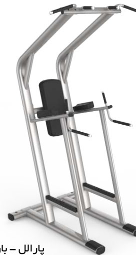
پارالل - بار فیکس

Product Size: 780*8400*1465 mm(LxWxH) Product Weight: 30 kg