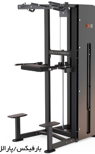
بار فیکس / پارالل کمکی

Product Size: 1240*1420*1800 mm (LxWxH) Product Weight: 185 kg Weight Stack: 75 kg