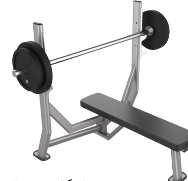
نیمکت پرس سینه

Product Size: 1230*440*400 mm (LxWxH) Product Weight: 13 kg