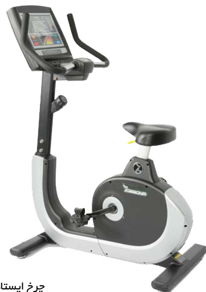
چرخ ایستاده بدون پشتی