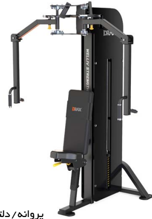
پروانه / دلتوئید