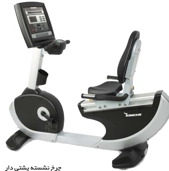
چرخ نشستہ پشتی دار