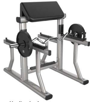
میز جلو بازو لاری