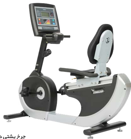
چرخ پشتی دار