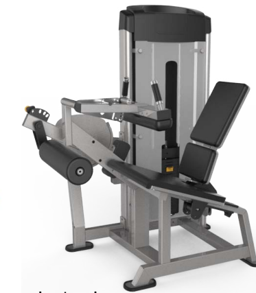
پشت ران نشسته

Product Size: 2010*1020*1800 mm (LxWxH) Product Weight: 210 kg Weight Stack: 100 kg